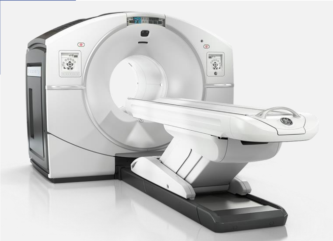
Advanced medical imaging PET-CT•MRI